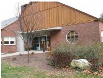
Leverett Elementary School