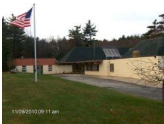
Swift River School