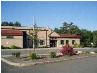
Shutesbury Elementary School