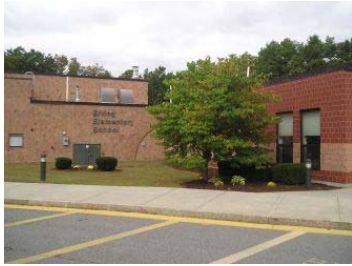
Erving Elementary School