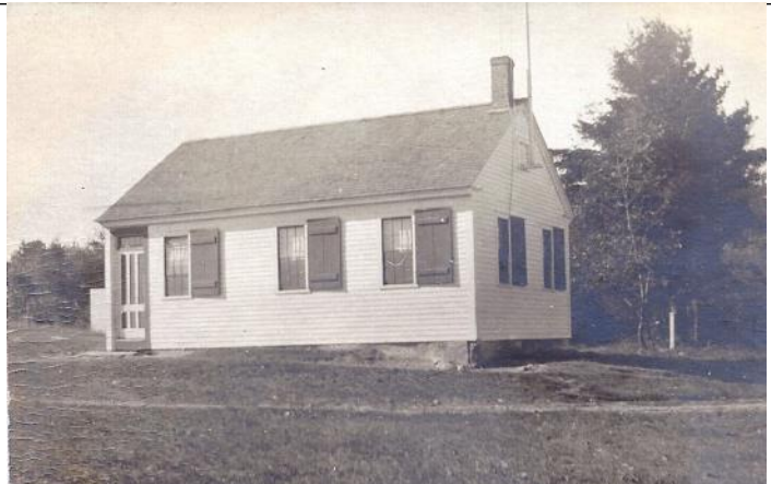
Front and back of a postcard of West School circa 1900