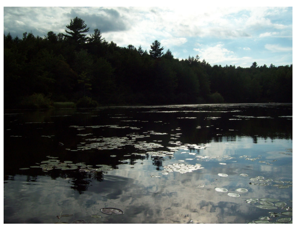
An August evening on Lake Wyola, as enjoyed from a library kayak.