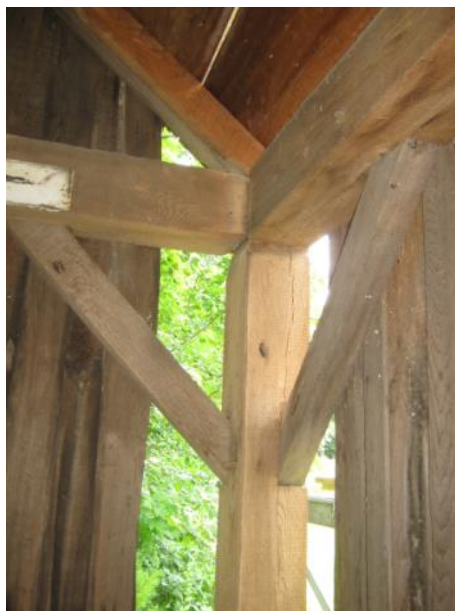
Classic post and beam construction at the West Cemetery Hearse House.