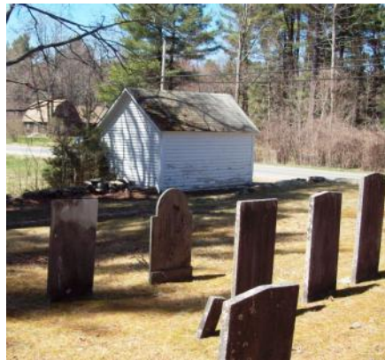
The 1840 Hearse House