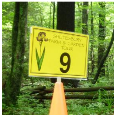
A welcome sign from a 250th Anniversary Farm & Garden Tour in 2011

Would you consider offering yours, or do you know of a great