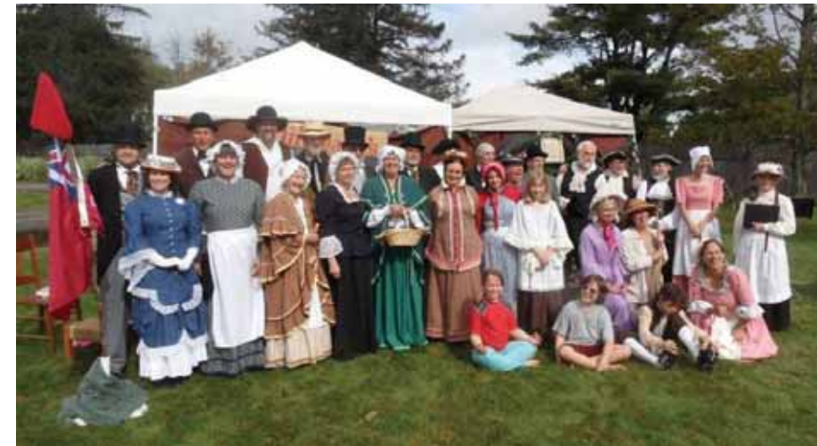
Curtain call from "The Tavern of Time: Scenes from Our Story, 1761-2011," Celebrate Shutesbury, September 24, 2011.