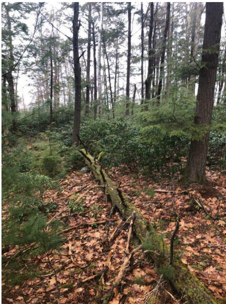
Photo of Sample Plot North