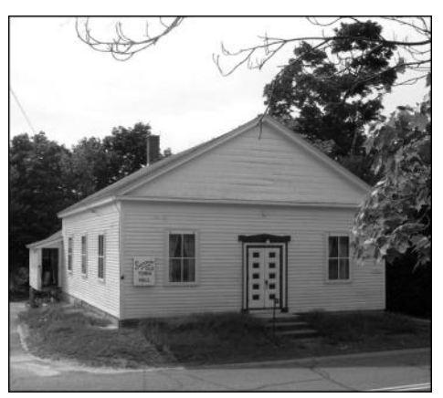
Shutesbury's Old Town Hall

There will be meetings of the CPC and Town Buildings Committee to discuss this potential project. Please watch the town calendar for dates and times.