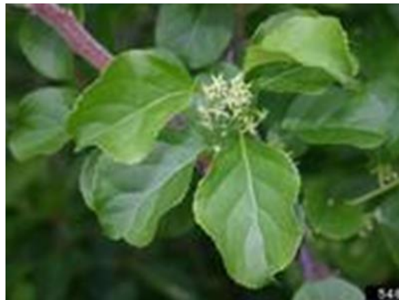
Fall berries and summer leaves of Oriental Bittersweet