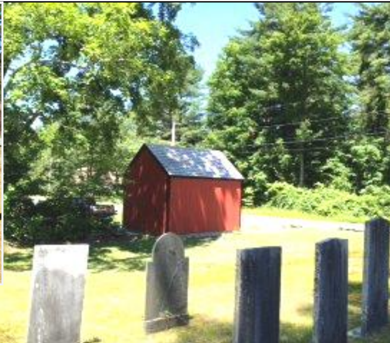
Before and after: The Hearse House

First and foremost, the Commission wishes to recognize with appreciation and gratitude the combined efforts of the many, many local volunteers and paid professionals for the time and good will invested into bringing the West Cemetery Hearse House (158 Leverett Road) back to its original 1840 glory.