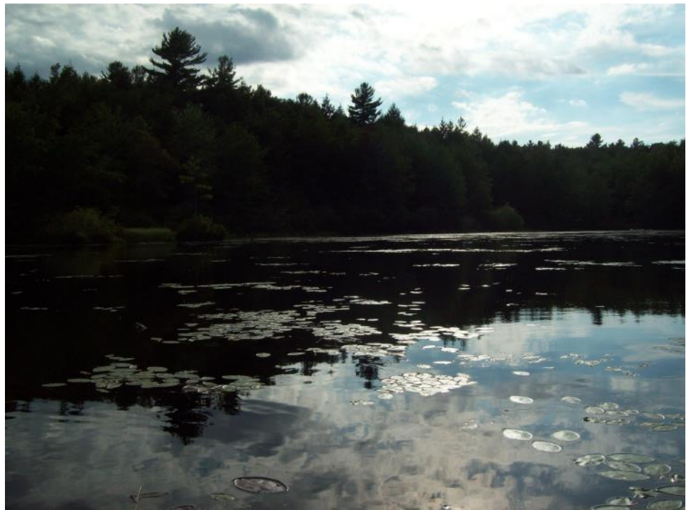
An August evening on Lake Wyola, as enjoyed from a library kayak.