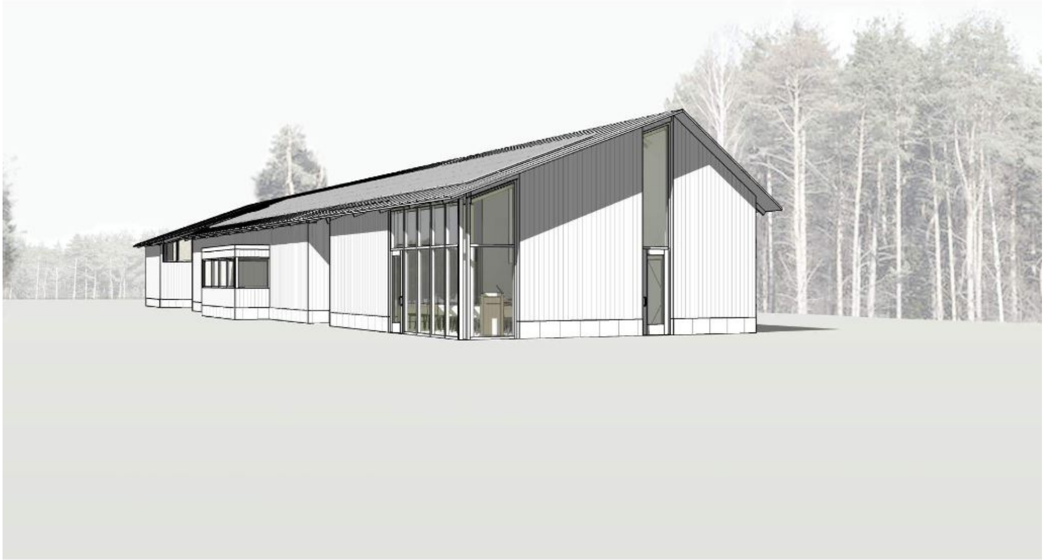
A view of the SE corner of the building. A 63kWh solar array, mounted on both sides, will provide 100 % of the building's electricity.