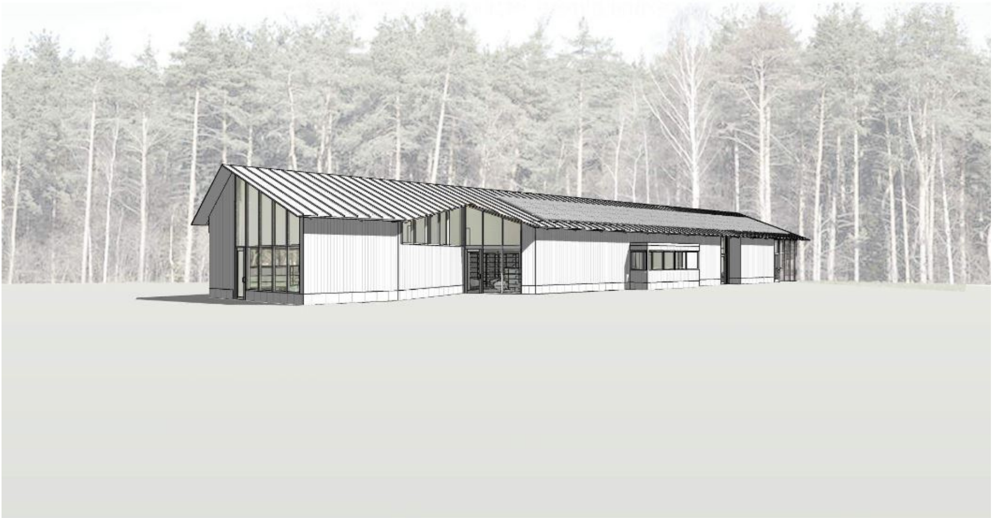
View from the NW corner. Children's area on the left, adult area on the right.