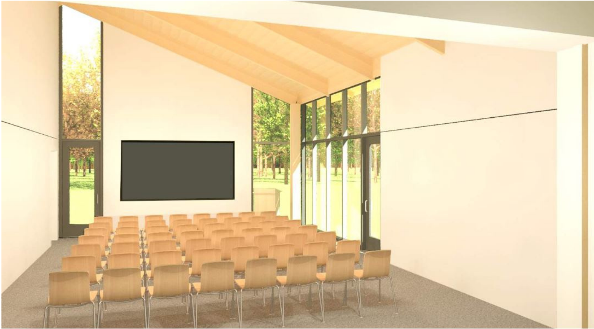
The Community meeting room, on the south end of the building, seats 49 and will have a wide opening into the lobby for overflow when needed.