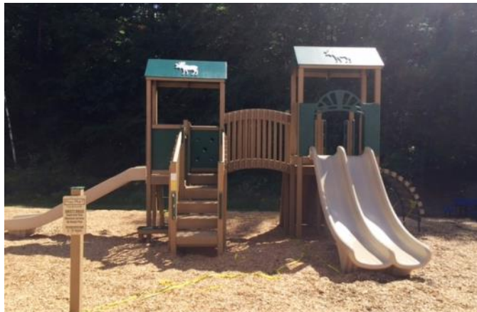
Just one of the structures in the new playground!

The Leadership Team of Union #28 (Superintendent, Director of Student Support Services, Director of Finance