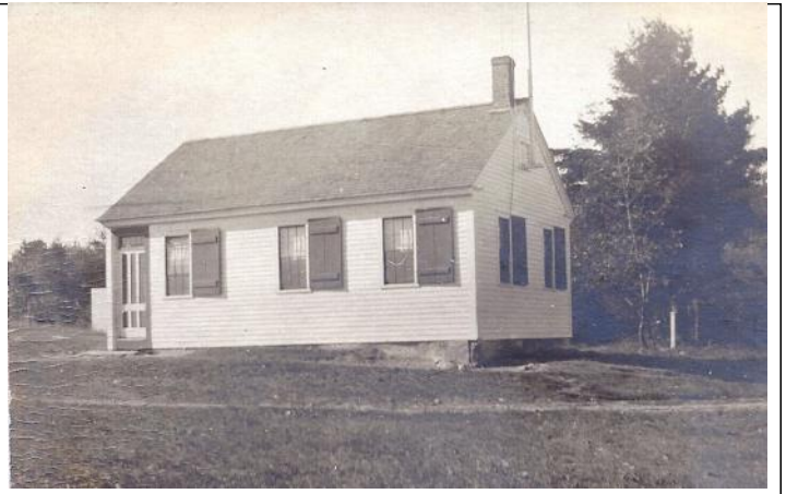
Front and back of a postcard of West School circa 1900