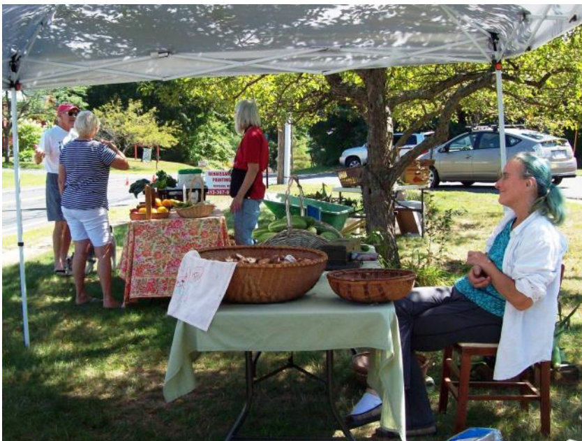
Flowers and produce abound at the Saturday morning Farmers Market.

You must be a Shutesbury resident, using your actual name and address, and join as an individual. Search engines and non-members do not see information posted or member info. If you have trouble joining, or questions, contact me at vlach@admin.umass.edu