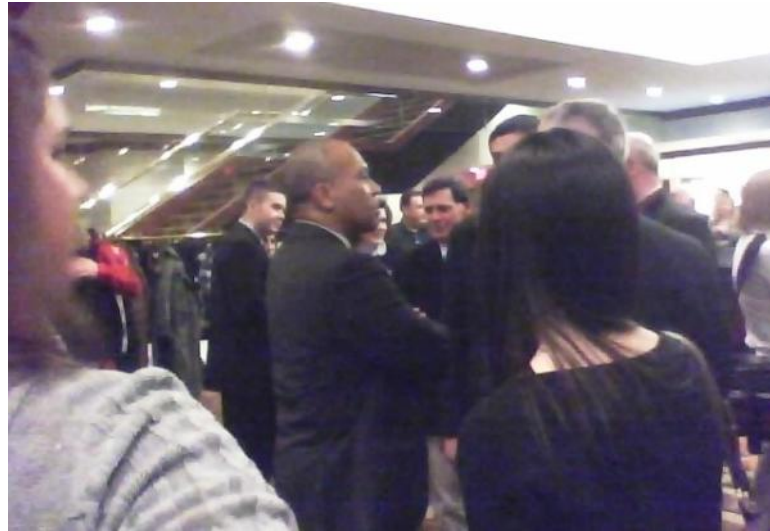
Mass. Gov. Deval Patrick talks with local and town officials at a reception during the recent annual meeting of the Massachusetts Municipal Association.

Why is the Governor's proposal to increase money to cities and towns extraordinary? Because over the last decade we have seen cuts and level funding to local aid paired with increased mandates at the state and local level. The Mass Budget and Policy Center cites local aid in Mas-