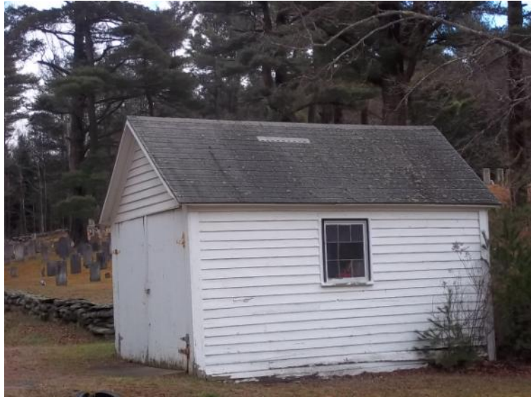
The 1840 Hearse House

Please feel welcome to become involved in any manner.