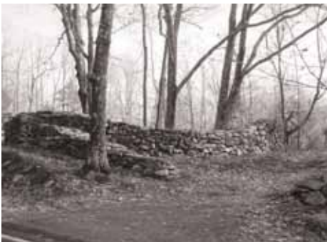
Stray livestock were once held for safe-keeping in the Town Pound.

If you have a question about, or an interest in, Shutesbury's history, if