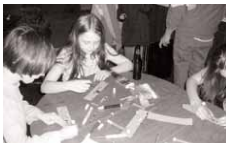
Artists at a recent Shutesbury Athletic Club dinner personalize links for a 250-link paper chain being created this year to help residents visualize the span of time.

Suggested donation for the dinner is $5 per person.