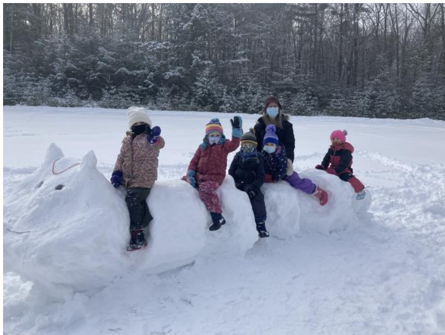
Outdoor time for Preschoolers at Shutesbury Elementary!

This screening is available to all families in town, including those with a child not already enrolled in the school's preschool program.