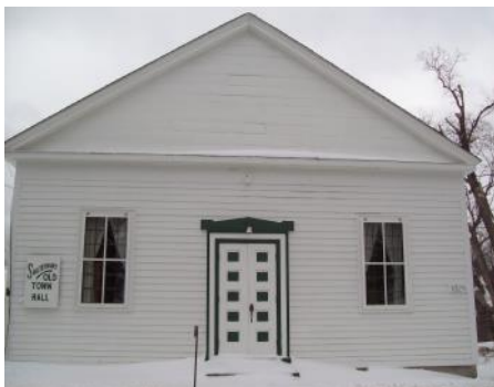
The site of Shutesbury Town Meetings in the 19th century

Permits, good for one day only, are available 7:30am - 1pm on days that burning will be allowed. Hours for burning are 10am - 4pm. Fires must be located at least 75 feet from any building and attended at all times by a person 18 years or older. Only brush may be burned – the burning of grass, leaves, stumps, building materials, trash, etc., is prohibited.