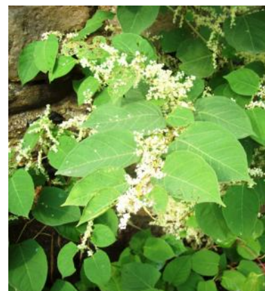
Knotweed on west side of Town Hall