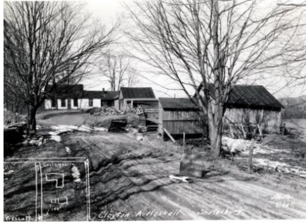
A long-gone farm on the path of October 12's hike.

On both Saturdays, we will car-pool from the Town Hall parking area at 12 noon. Hold Saturday, October 26 as a rain date if either the 5 th or 12 th are too rainy. Join us on one or both walks. Call 259-1204, if you can, to let us know you are joining us, for more information, or to check on any weather-related change.