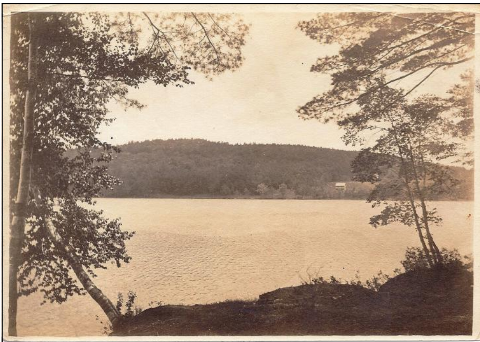
The view of Mount Mineral from Lake Wyola's west shore in 1911.