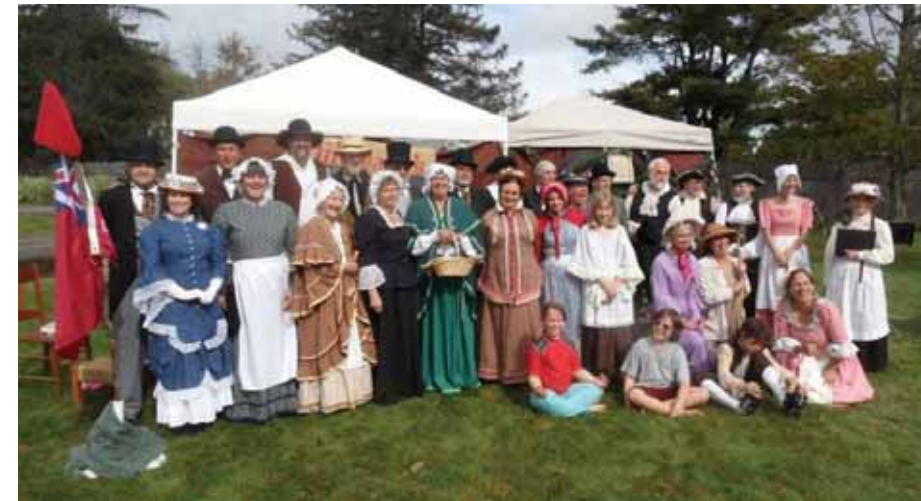
Curtain call from "The Tavern of Time: Scenes from Our Story, 1761-2011," Celebrate Shutesbury, September 24, 2011.