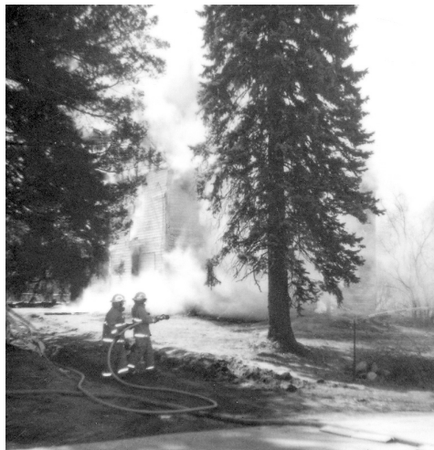
Shutesbury Firefighters practice at a "controlled burn" at 66 Leverett Road on April 16. The colonial house, set on land purchased by a Special Town Meeting last fall, was set ablaze after the town decided repairs would be too costly.